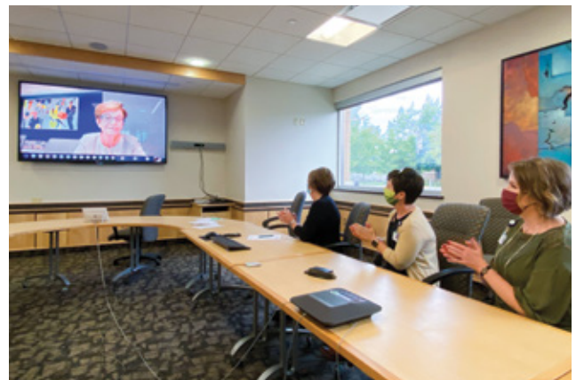
On September 15, 2021 the American Nurses Credentialing Center granted Kootenai Health Magnet recognition for the fourth consecutive time.

Magnet recognition has been shown to provide specific benefits to hospitals and their communities, such as higher patient satisfaction with nurse communication, availability of help, receipt of discharge information and higher job satisfaction among nurses.