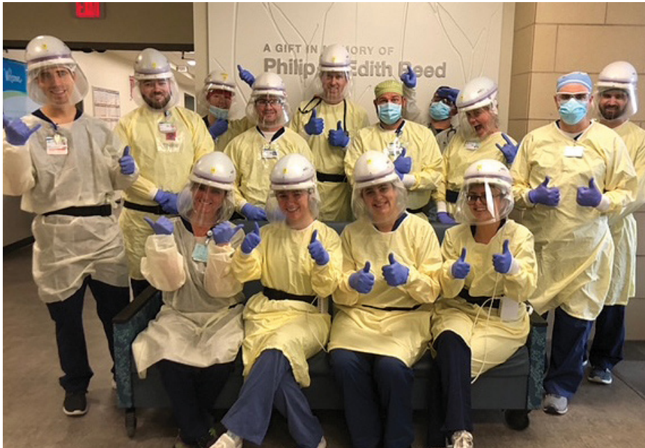
3 East Critical Care team thanking the community for their support during the COVID-19 pandemic.

2020 was an incredibly challenging year. When visitor limitations went into effect, your gifts funded technology to connect patients with their loved ones. When our community needed faster testing results, your gifts purchased a COVID-19 testing analyzer. And when staff needed a moment of respite, you were there through your support with notes of encouragement. Thank you for believing in our mission and the work of your local hospital.