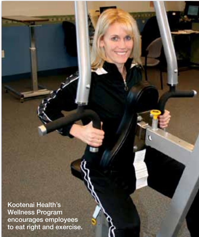
Kootenai Health's Wellness Program encourages employees to eat right and exercise.

Last year, the Wellness Councils of America (WELCOA) designated Kootenai as one of the nation's Well Workplaces.