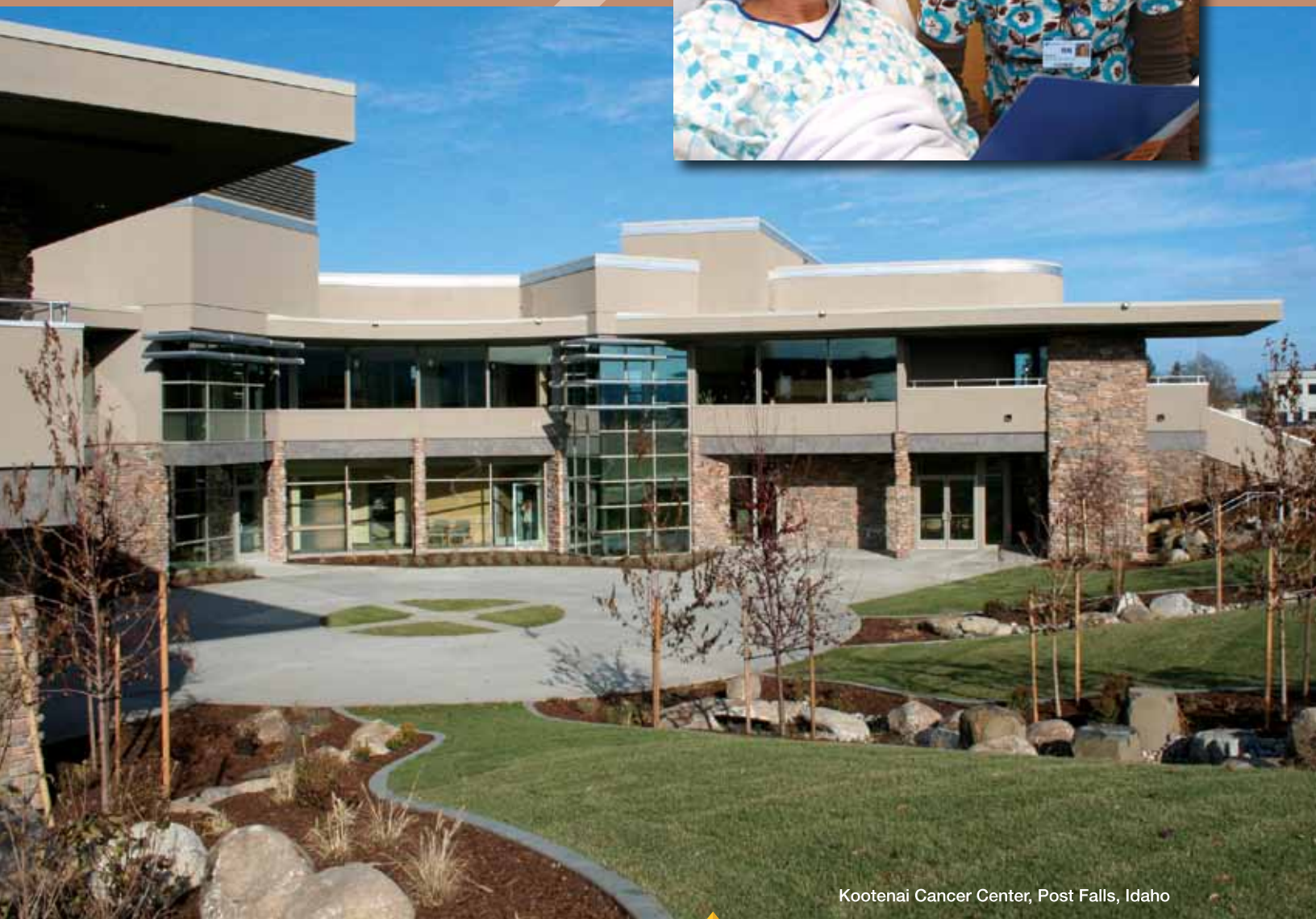
Kootenai Cancer Center, Post Falls, Idaho